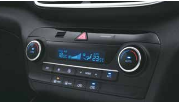
Dual zone FATC with auto defogger

Other features : Leather* touch on dashboard | Rear AC vent | 60:40 Split folding rear seat | 2nd Row seat with reclining function