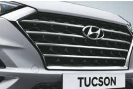
Cascade design bold front grille