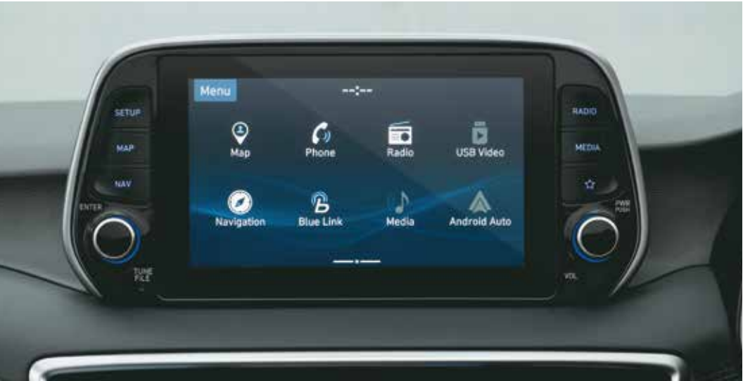
20.32 cm (8 inch) HD audio video navigation system