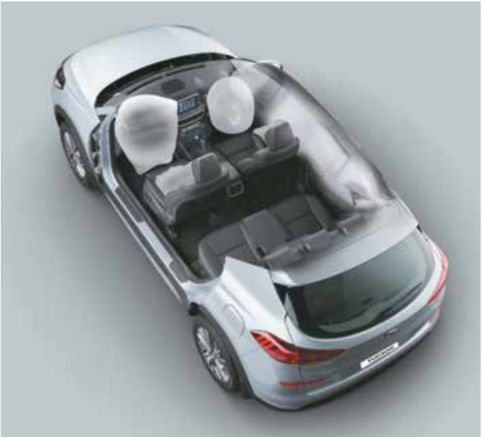
6 Airbags (driver, passenger, front side & curtain)

The new TUCSON has a host of advanced safety features to ensure nothing comes between you and your destinations. Drive with complete peace of mind and enjoy all your journeys.