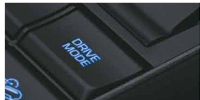
Drive mode select