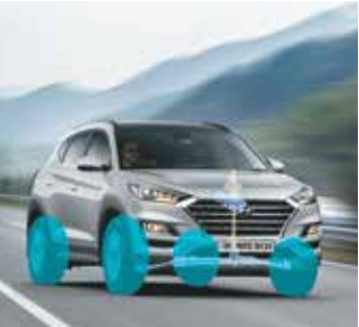
Vehicle stability management (VSM)