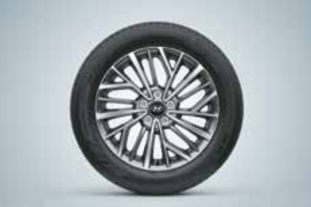
R18 (D=462 mm) diamond-cut alloy wheels