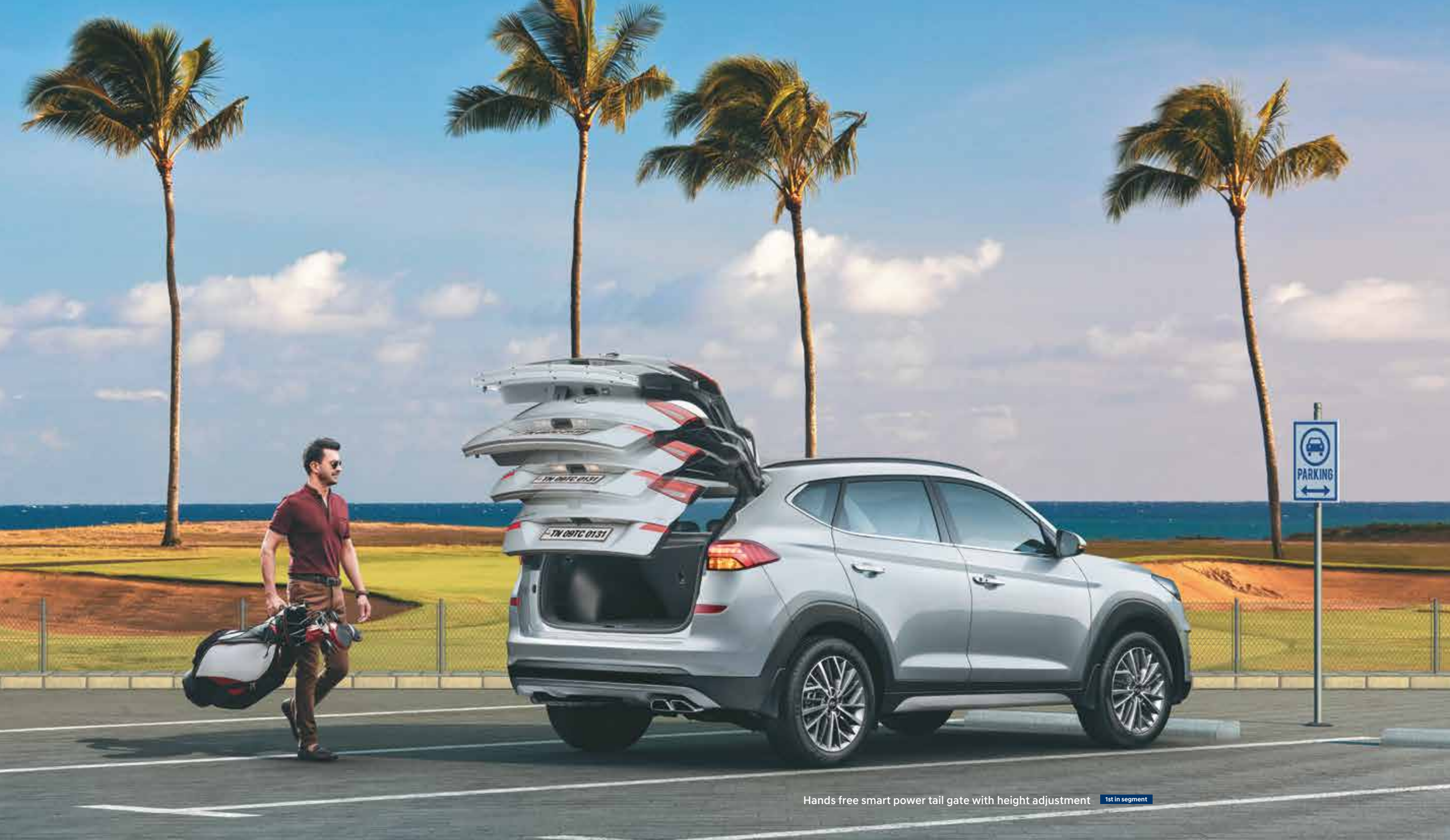
Hands free smart power tail gate with height adjustment 1st in segment