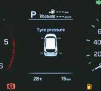
Tyre pressure monitoring system (TPMS) with display on cluster