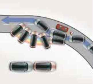
Electronic stability control

Other features : Brake assist | Child seat anchor-ISOFIX | Down hill brake control