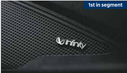
Infinity premium sound system (8 speakers)

The new TUCSON comes with Hyundai Blue Link technology to give you a state-of-the-art connected car experience. Now communicate with your car from wherever you are.