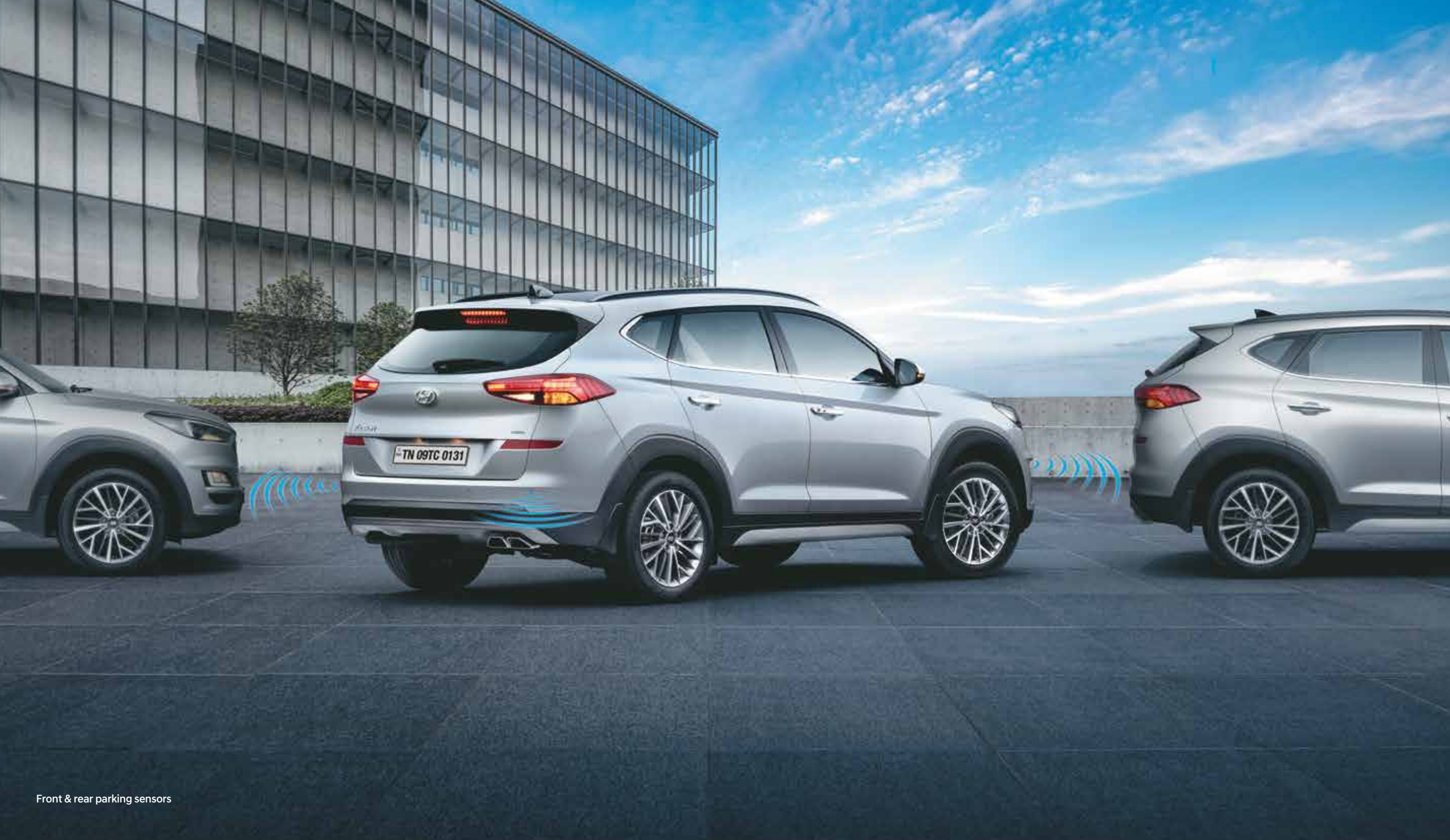
Front & rear parking sensors