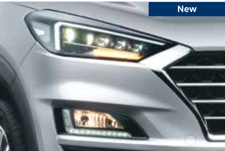
Penta projector LED headlamps with LED DRLs

The new TUCSON exudes class and power in equal measure. Its stylish design, sleek lines and bold stance stand out no matter what environment it is in.