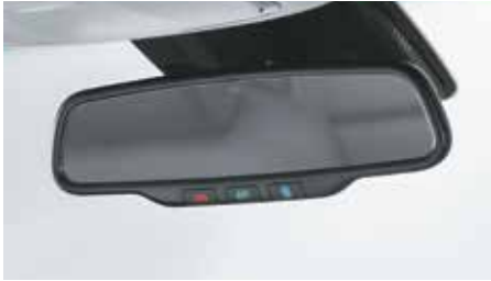
Auto dimming IRVM