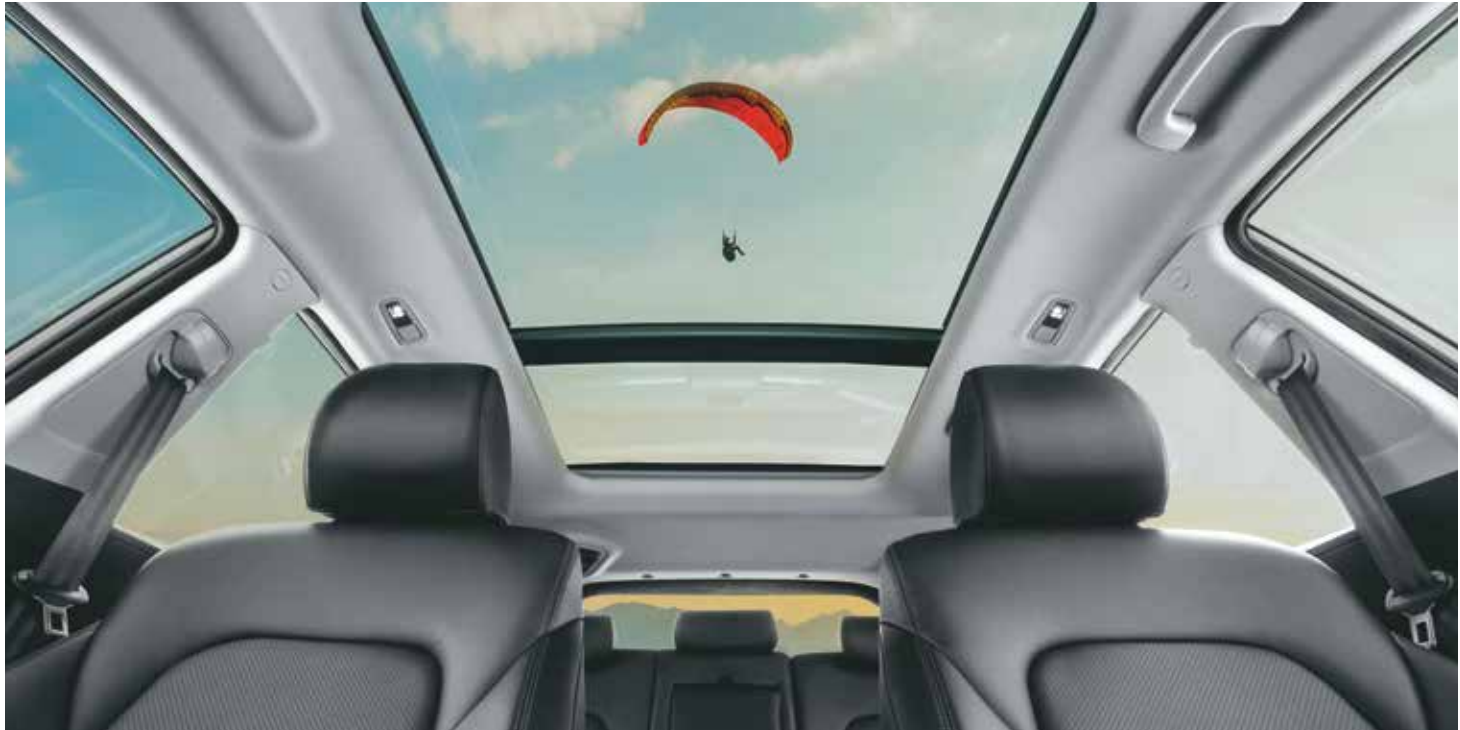
Electric panoramic sunroof

We made sure all your journeys are a breeze irrespective of the terrain because of the luxury and comfort offered by the new TUCSON, the premium SUV.