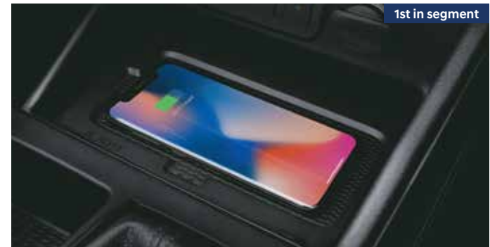
Wireless phone charger