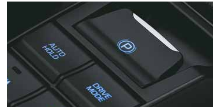
Electric parking brake