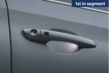
Chrome outside door handles with front pocket lighting

Other features : Twin chrome exhaust (diesel only) | Roof rails | LED static bending lamps | Front & rear fog lamps | Chrome finish beltline